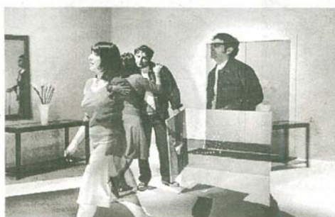
Michael Snow (Canadian, born 1928), "Digital Still from Sshoorrrty ," shot on 35 mm film.

Buffalo continues to enhance its cultural landscape with the