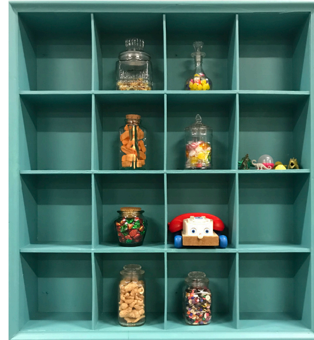
Obsidian Bellis Apothecary for Sis