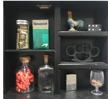
The Phoenix , 2019, assemblage in a painted wood cabinet

Cover image: Treasures for Young Hearts , 2019, painted wood shelf, glass jars of toys, snacks, beads, buttons