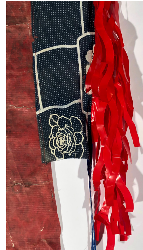
Dressed (detail), 2019, sunned tarp, curtain, cotton thread, plastic