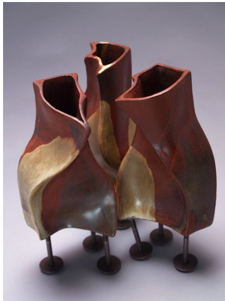
Deborah Stewart, Flock #3 , ceramic, 2019.