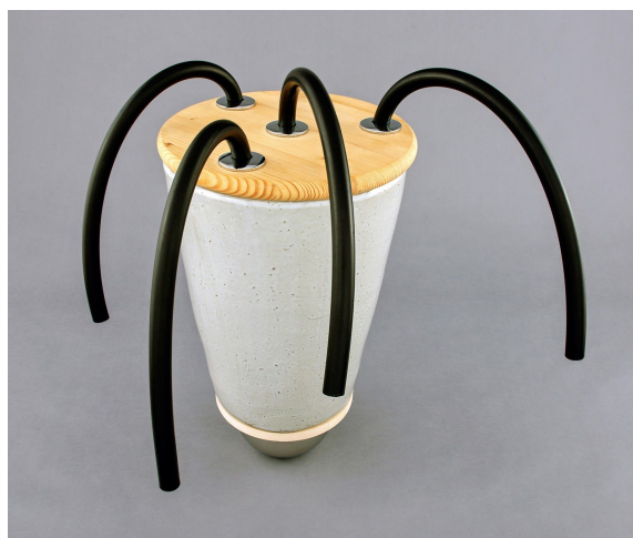
Lee Hoag, Fallout , 30"x29"x24", mixed media assemblage, 2018.