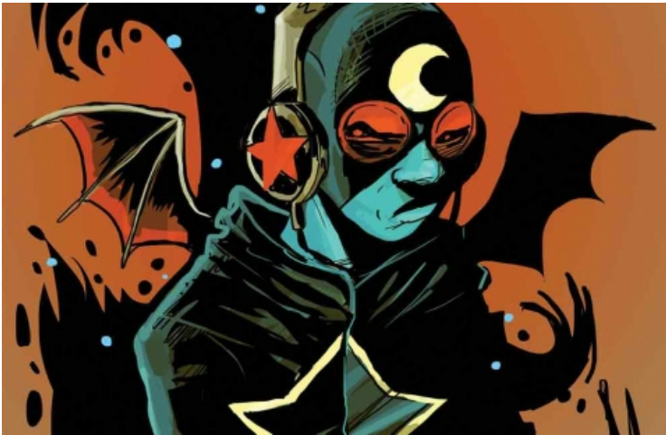
Night Boy tells the story of a fifteen-year-old victim of police brutality.