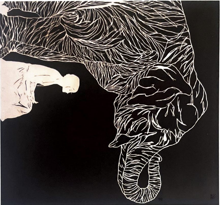
Maude White You Were Wild Here