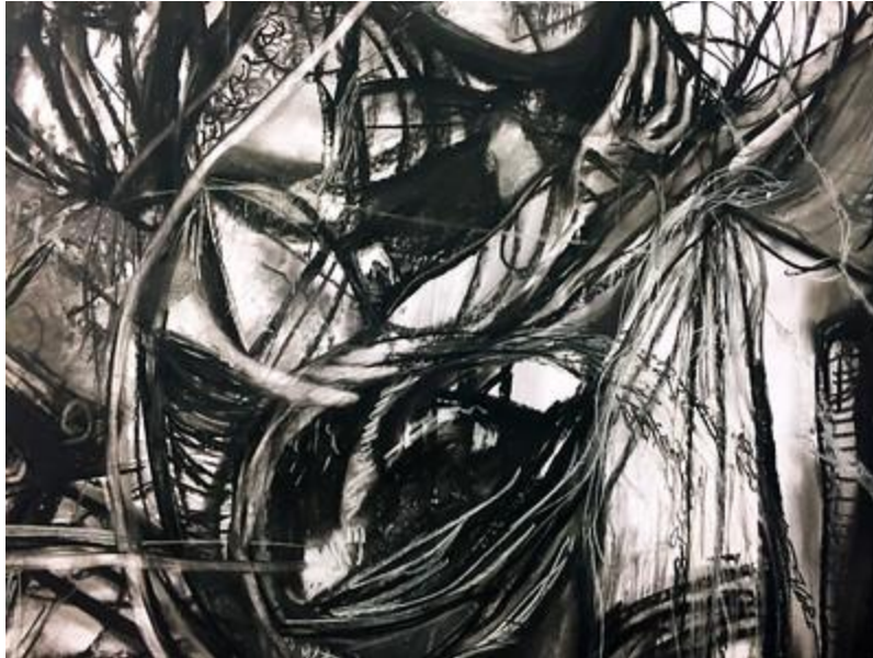
Oreen Cohen, Darkest Dark , 2020, charcoal on paper

These new prints explore the nature of stability through color, gesture, and composition. Although her palette is limited, Sherin achieves a wide range of surface texture and color density. The physicality of her process can be seen in the sweeping arc of liquid carborundum that produces dark ink marks pressed deeply into the paper as well as in the rich surfaces created by repeatedly rubbing ink on and off the plate. Many of her pieces are clearly assembled, boldly cut, and collaged from distinct parts. The final works capture precarious moments of stability amidst the chaos of contemporary life.