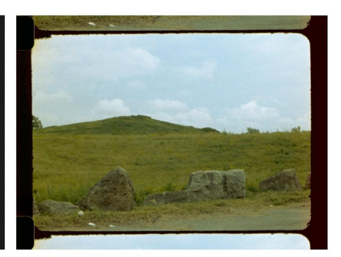
Carl Lee, Unity Island, 2022, triptych prints of stills from the film

Buffalo Arts Studio presents Carl Lee's Unity Island , a film installation about a ¼ square mile piece of land in Buffalo, NY. Lee's practice examines ideas of perception, memory, and the spatialization of time using simple formal means. Unity Island is on display September 22–November 3, 2023 , with an Opening Reception on Friday, September 22, 5:00–8:00 pm . The exhibition and reception are free and open to the public.